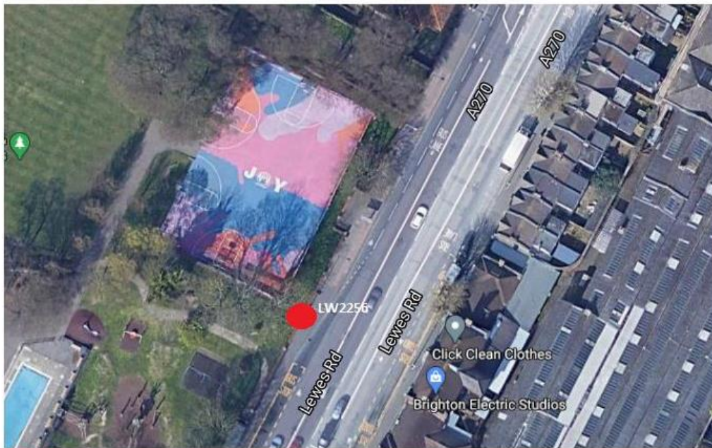
Lewes Road/ Hollingdean Road Northbound Map (Rear- Facing Camera LW2256)